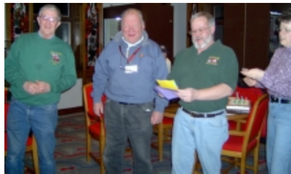
The punch line! Please the punch line! Please clap after the punch line!

Big Green, the largest of the three layouts, is the largest G-gauge modular layout in the United States and has been exhibited at two national large-scale model railroad shows. On March 8th and 9th, 2003, it was exhibited at the Milford Middle School to help raise funds for the Milford Lions Club.