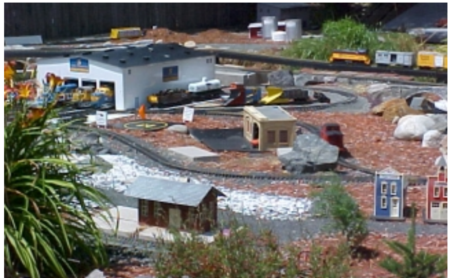
Actually taken by the pilot as Lefty demonstrates his kung-fu grip on the "Oh-My-Gosh!" bars, this photo shows an aerial view of the recent expansion by Suleski Transportation.