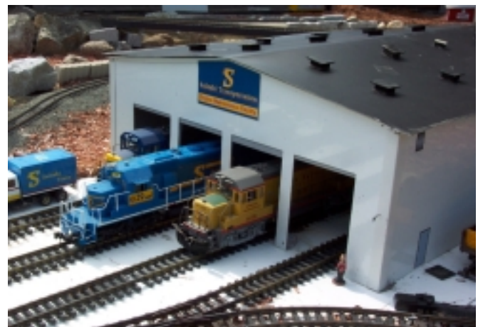
Lefty looks over the operations at Suleski Transportation's engine house while waiting for the Suleski corporate helicopter to arrive.